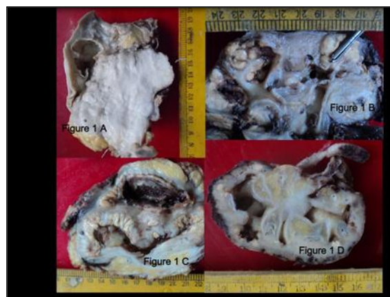
Figure 1: Showing gross features of XPN, note the loss of normal renal parenchyma

showed scanty remnants of Wilm's tumor (neoplastic tubules along with stroma) in the background of XPN.